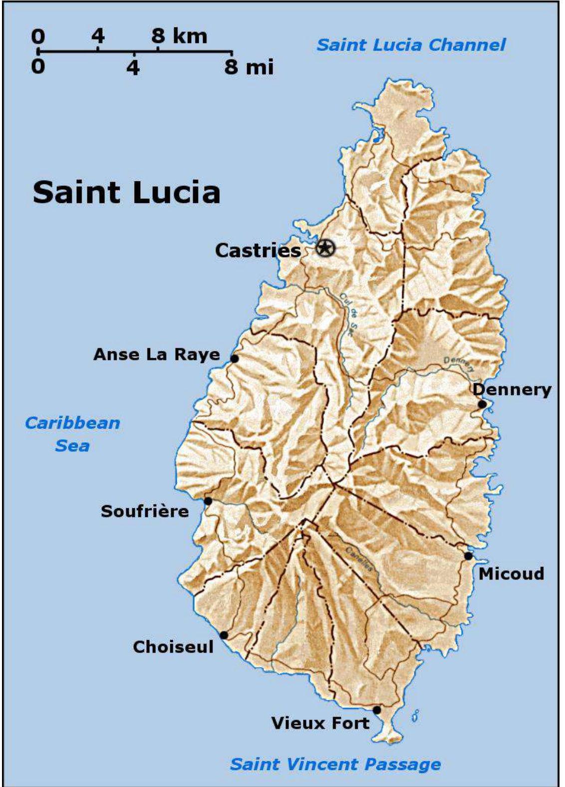
Figure 3. Map of Saint Lucia<sup>5</sup>