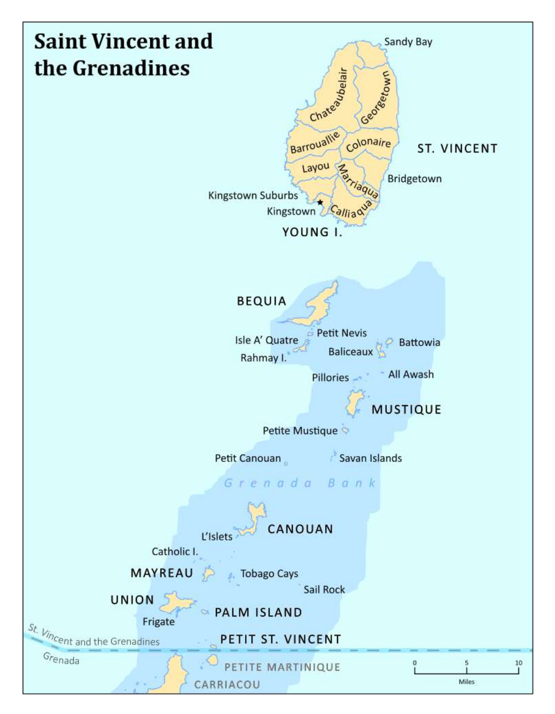
Figure 4. Map of St. Vincent and the Grenadines<sup>6</sup>